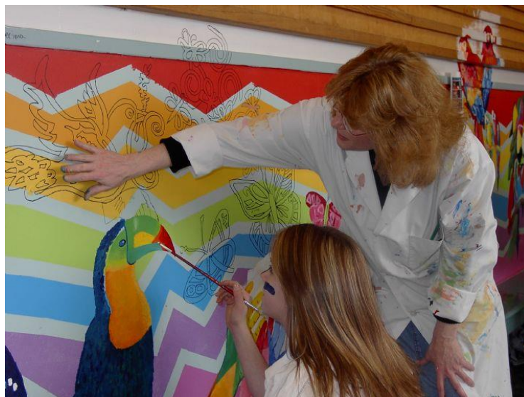
Mural completed by students at Allendale School Edmonton Alberta

Murals bring art into the public sphere. Mural artists are often commissioned by public bodies to enhance buildings with colourful depictions of historical and daily life. In Alberta, towns and cities abound in murals — and there is room for many more. The Paint Spot has been helping mural artists for a long time, and has amassed practical knowledge on the creation and preservation of murals. We can help the mural artist to plan, prepare, paint, preserve, and price murals. Mural Notes is designed so that you can find out what you need to know, but if you have further questions, the store staff will be happy to assist.