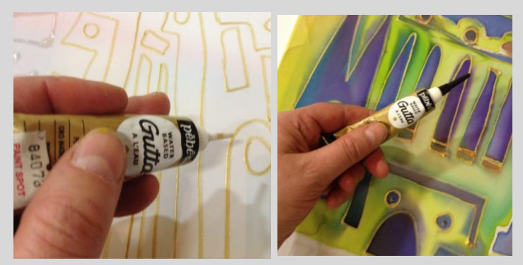
Pebeo Gutta comes in an easy-to-use applicator. The resist stays on the fabric and will not wash out. It will leave a slight raised texture on the material.