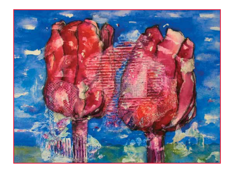
Finally, make the background more intense by using more blue.