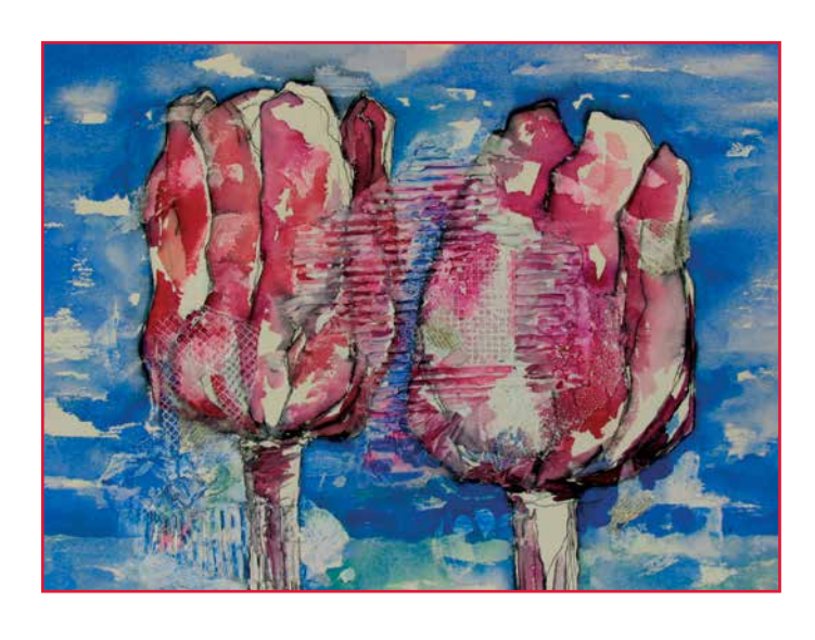
STEP 4: Paint the sky with cobalt blue and brilliant blue. Use more red in the tulips for greater saturation.