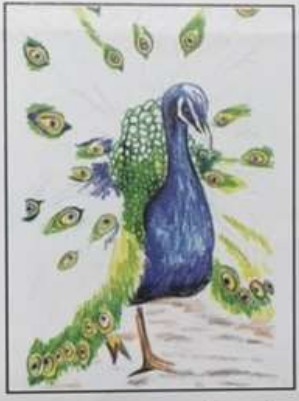
Add color lightly at first. The pencil stroke should follow the direction of the shape being filled in.