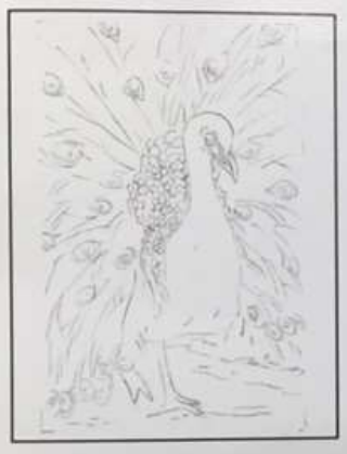
Lightly sketch design on drawing paper with a very sharp pencil.