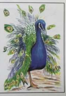
Blend colors by coloring heavily over dark colors with light colors to smooth them out - this is "burnishing."