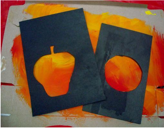
Fruit cut-outs - Junior High

Glue them, using acrylic gel, to other recycled cardboard or to 4-ply railroad or Bristol board.