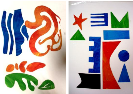
Geometric versus organic - Elementary