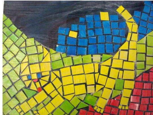
Mosaic cat - Senior High